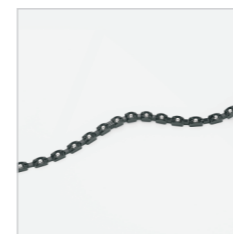
LINEARlight Flex Backbone