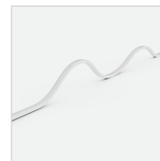
LINEARlight Flex DIFFUSE G2 TOP